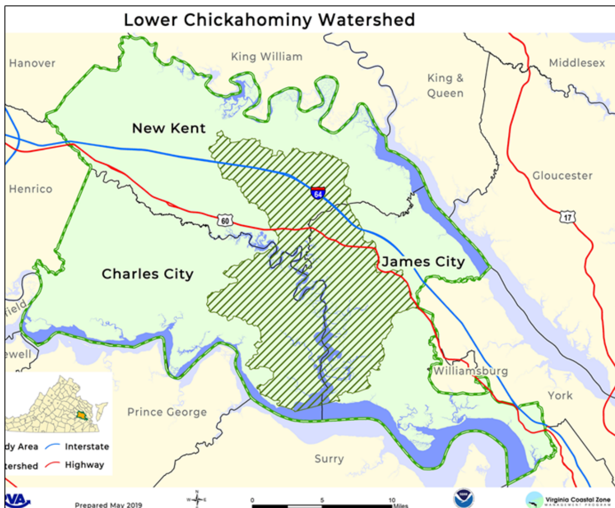
Figure One. The Lower Chickahominy Watershed

the middle 20% of streams analyzed in the program and have been identified as restoration candidates. While these bodies of water have suffered some ecological degradation, they maintain aspects of ecological health and present as strong candidates for restoration efforts. The Lower Chickahominy study area has a higher percentage of land and water area recognized in the Virginia Ecological Value Assessment (VEVA) as having either Outstanding or Very High ecological value compared to the entire Coastal Zone of Virginia; 39% compared to 34%. Therefore, the three counties of the Lower Chickahominy represent a concentration of ecologically valuable land and water habitat.